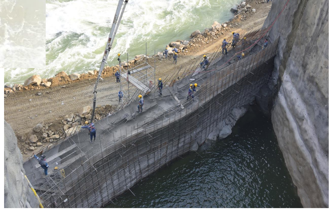
Discharge 4. July,2019