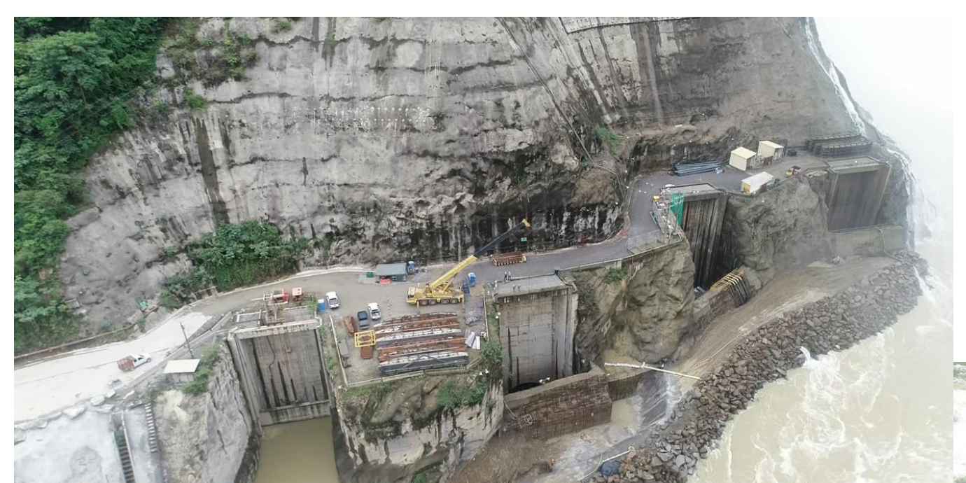
Road Access between discharges 3 and 4. July,2019