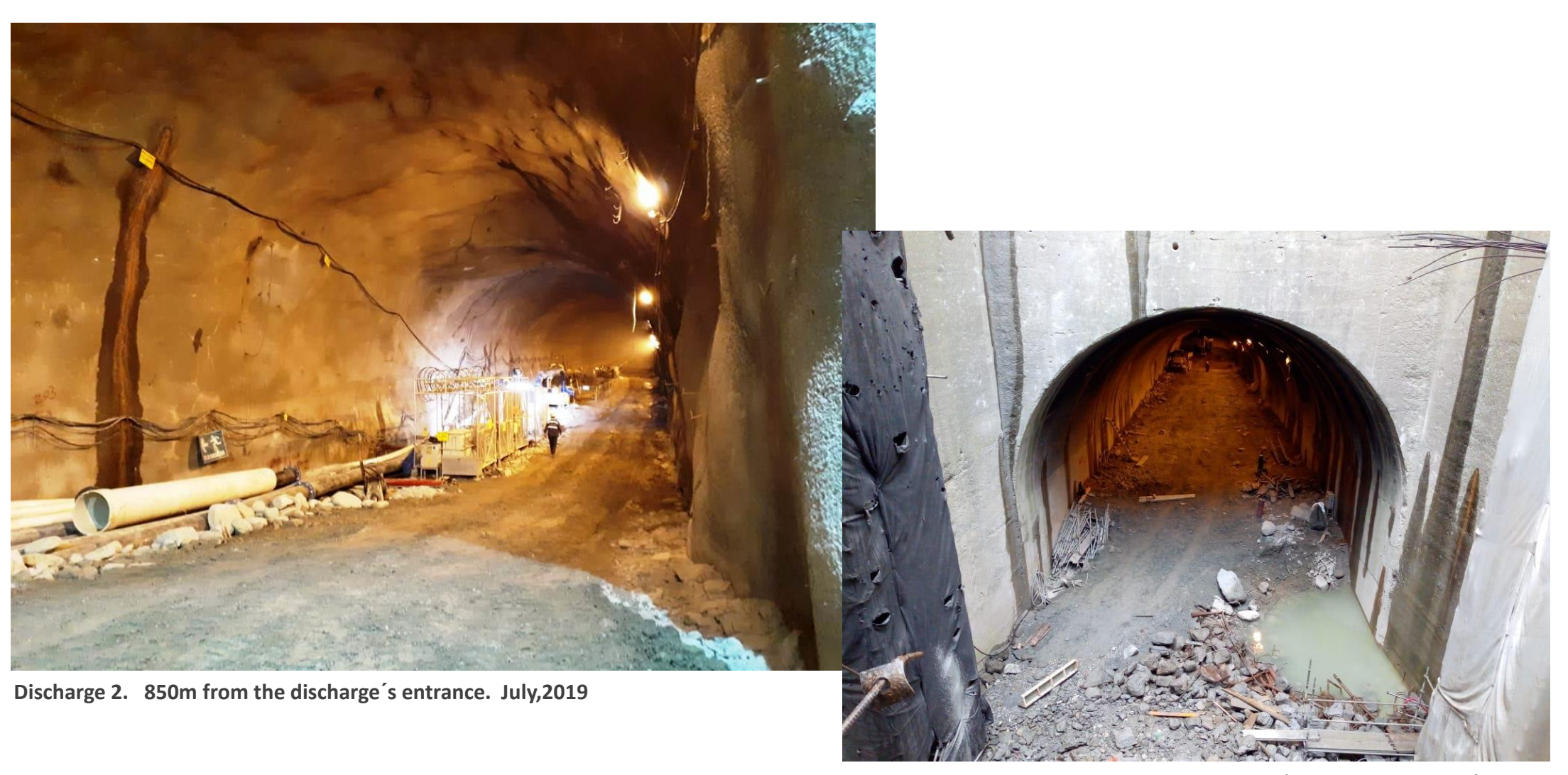
Discharge 3 entrance. July,2019